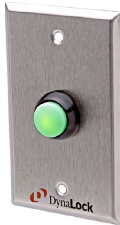
SHOWN WITH LED BACKLIGHT ILLUMINATED